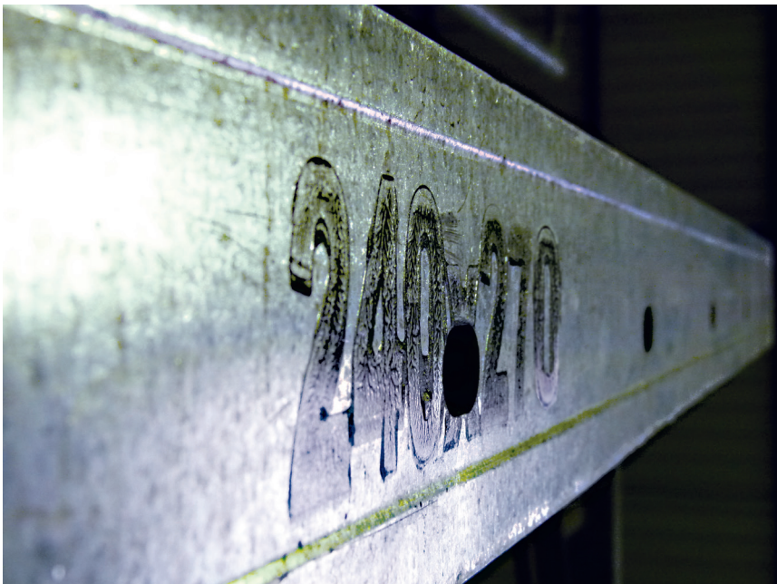
► Longer service life due to the robust, galvanized steel frame profile with 12 cm thickness