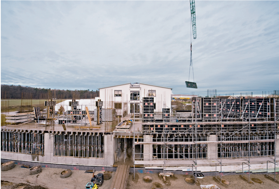
► RASTO: The ideal formwork for smaller and medium-size projects, particularly in the housing sector.