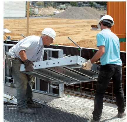
► RASTO-TAKKO application as a foundation formwork