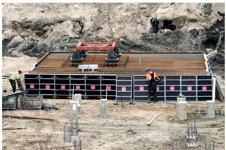
► Craneless forming possible due to low weight of basic RASTO and TAKKO panels