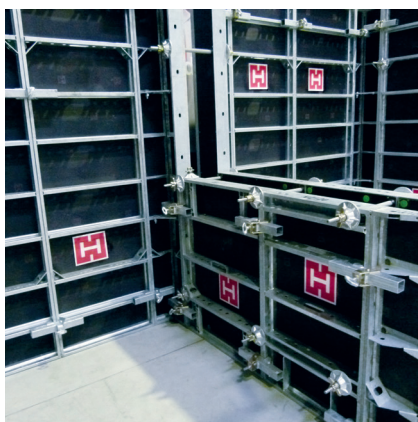
► Highly versatile wall formwork system with the same connection elements for every project size

Craneless forming possible due to low weight of basic RASTO and TAKKO panels RASTO aligning clamps provide a strong, tight and flush panel connection in just one working step RASTO XXL panel for large-area forming