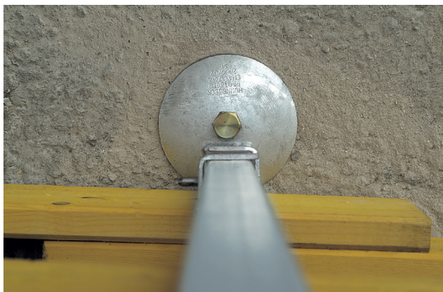
► Screw base joint can easily be fixed to the base slab

Highly durable and robust system parts due to the complete galvanization of all steel components