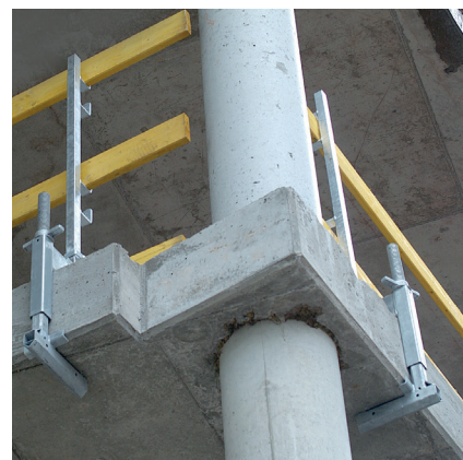
► Versatile modular system composed of just a few robust basic components