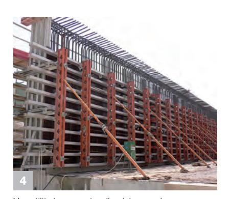
Versatility to support walls, slabs or columns