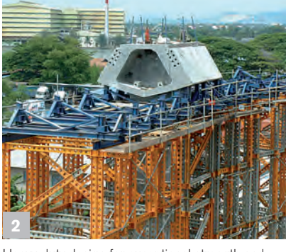
Heavy-duty design for exceptional strength and rigidity