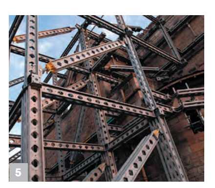
Economical and adaptive use allowing horizontal, vertical or inclined connection, e.g. in facade retention