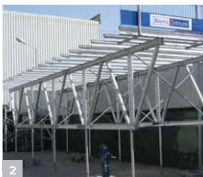
2 C-system circular post integrates readily with traditional scaffold couplers