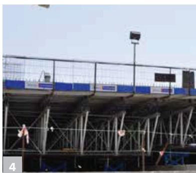
4 Easy to maneuver