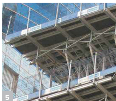
5 Inbuilt toe board