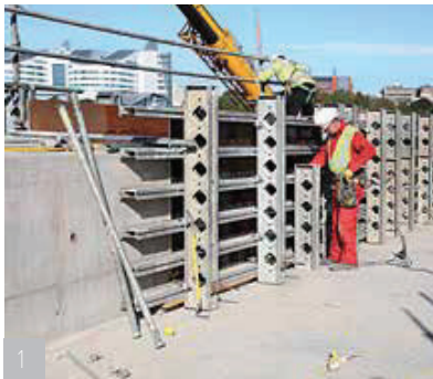
1 Fast and simple installation saving labour related costs