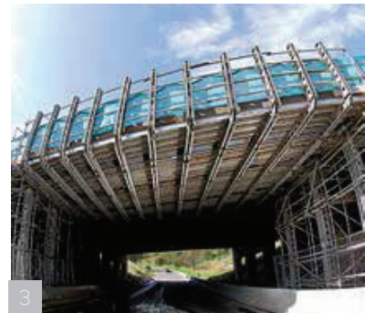
3 Compatibility with a variety of systems