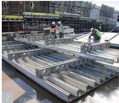
2 Highly durable representing a good investment