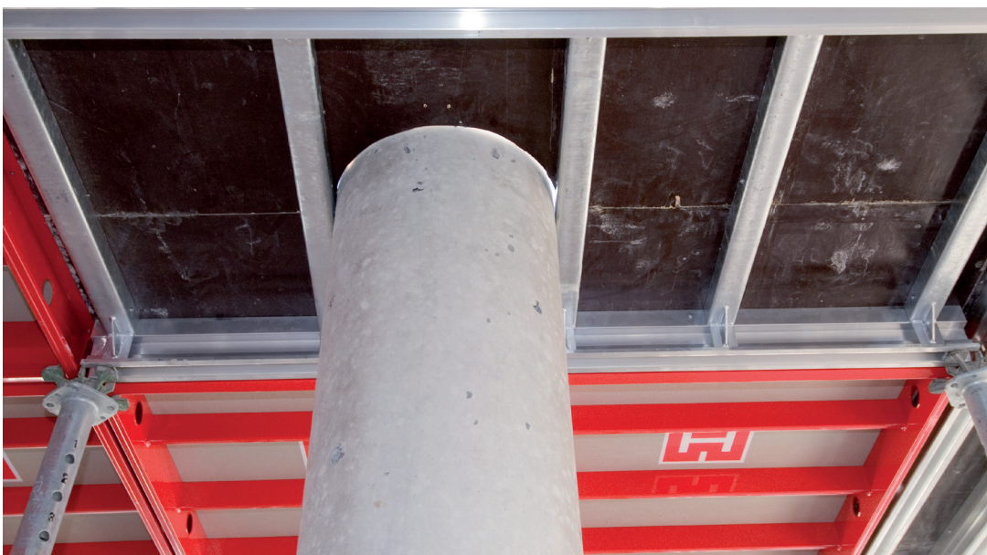
► Columns and other obstacles are easy to work around with TOPEC's adjustment solutions

Versatile due to various adjustment parts and alternatives TOPEC can be used in combination with TOPMAX floor tables and serves as an ideal and speedy fill-in solution for adjustment areas Adjustment panels can continuously extend in widths from 55 to 90 cm with no extra props required